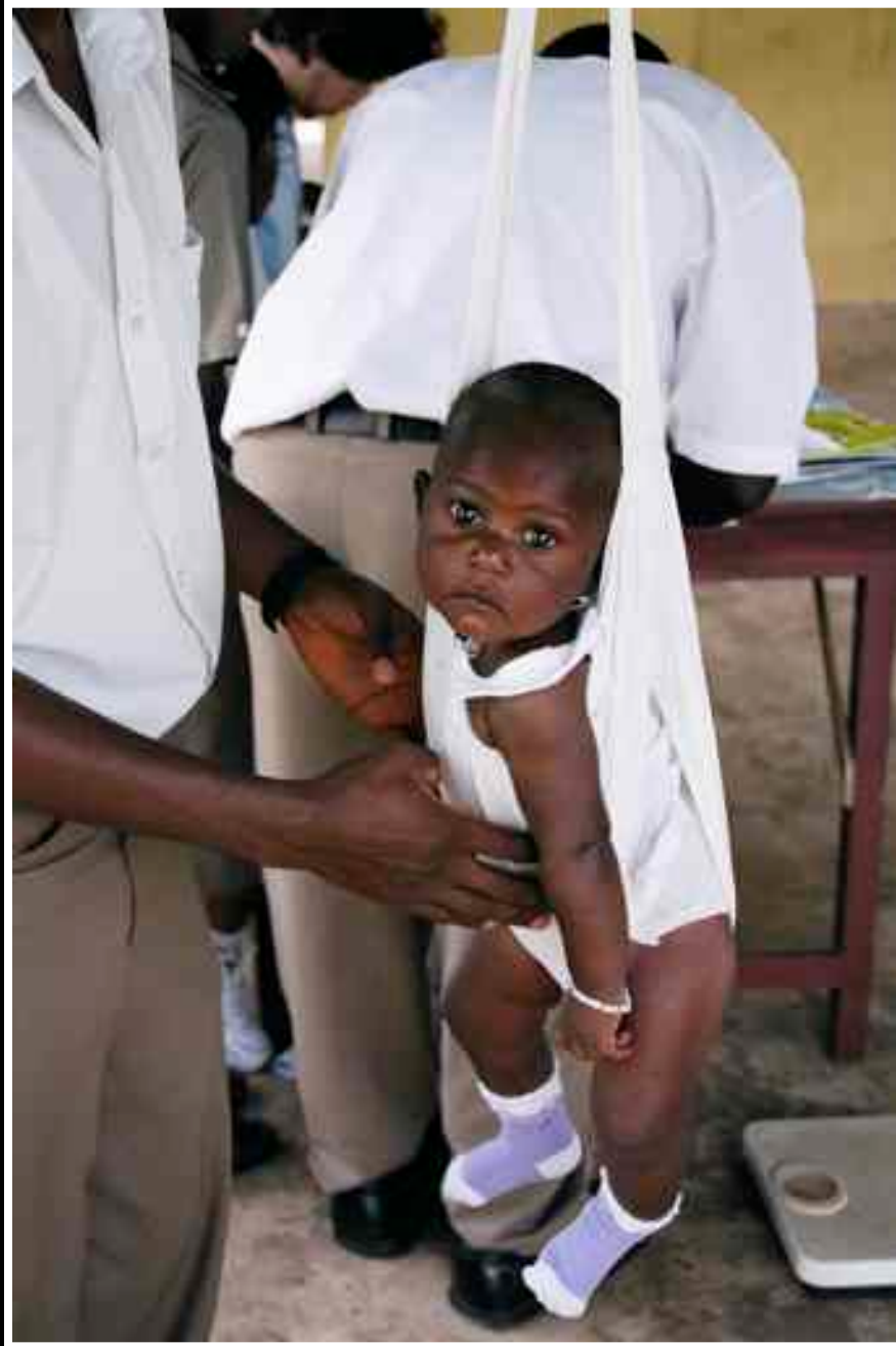
An infant is weighed at a child welfare clinic in Abor, Volta Region, March 2006.