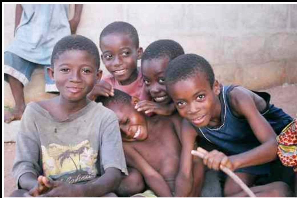
Children play by an abandoned building project, Abor, March 2006.