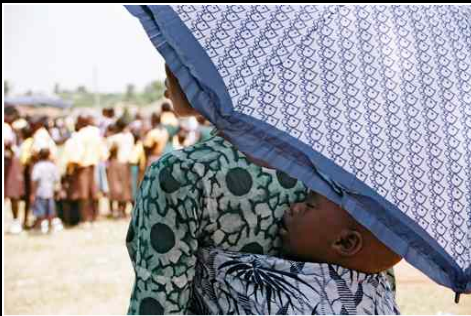
A mother uses an umbrella to shade her infant from the sun while watching the Independence day parade, March 6 th , 2006, Abor, Volta Region