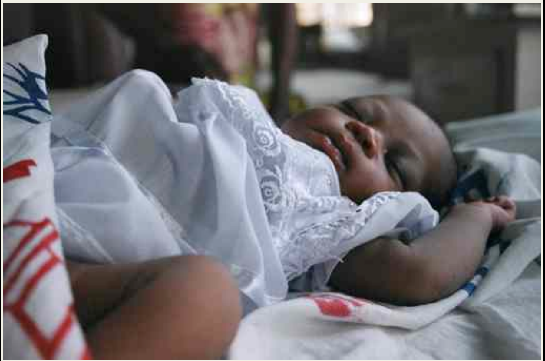
A day-old baby girl sleeps peacefully despite all the noise in the crowded maternity ward at Sacred Heart Hospital in Abor, Volta Region, March 2006.