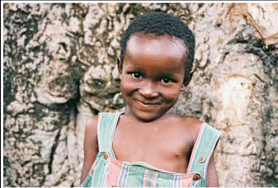
Children in the slums of Tamale, Northern Ghana, an area plagued by rolling blackouts and lack of potable water. August 2007.